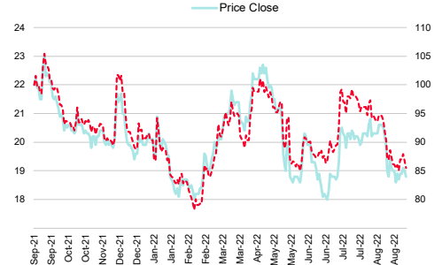
Bangkok Chain Hospital (BCH TB)